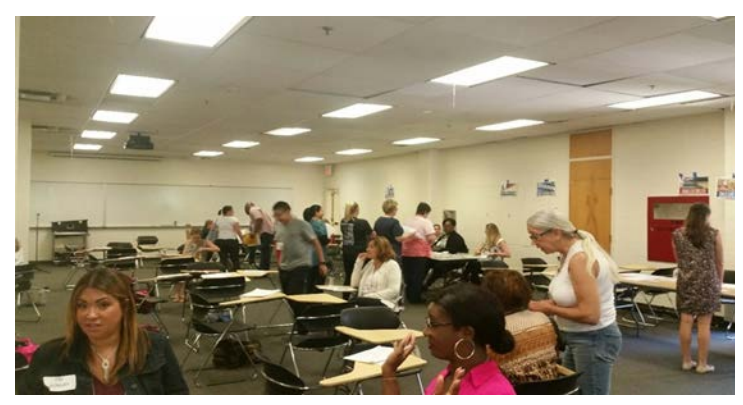
Community Action "Poverty Simulation" June 24th, 2017

NJAC, in collaboration with TCNJ, hosted a Poverty Simulation for coaches, nurses, volunteers, and other partners. In this unique opportunity, participants assumed the role of low-income family members living on a limited budget. As they tried to survive 'a month in poverty,' family members were forced to make hard decisions in order to provide for their families. Followed by a debriefing session, participants were able to gain a better understanding of the situations families living in poverty face from day to day.